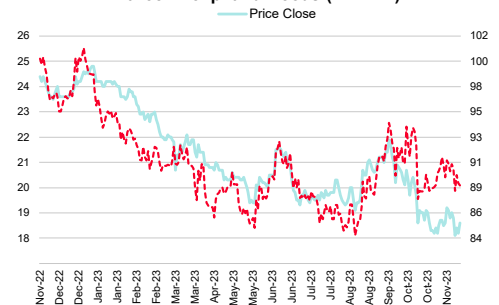
Charoen Pokphand Foods (CPF TB)